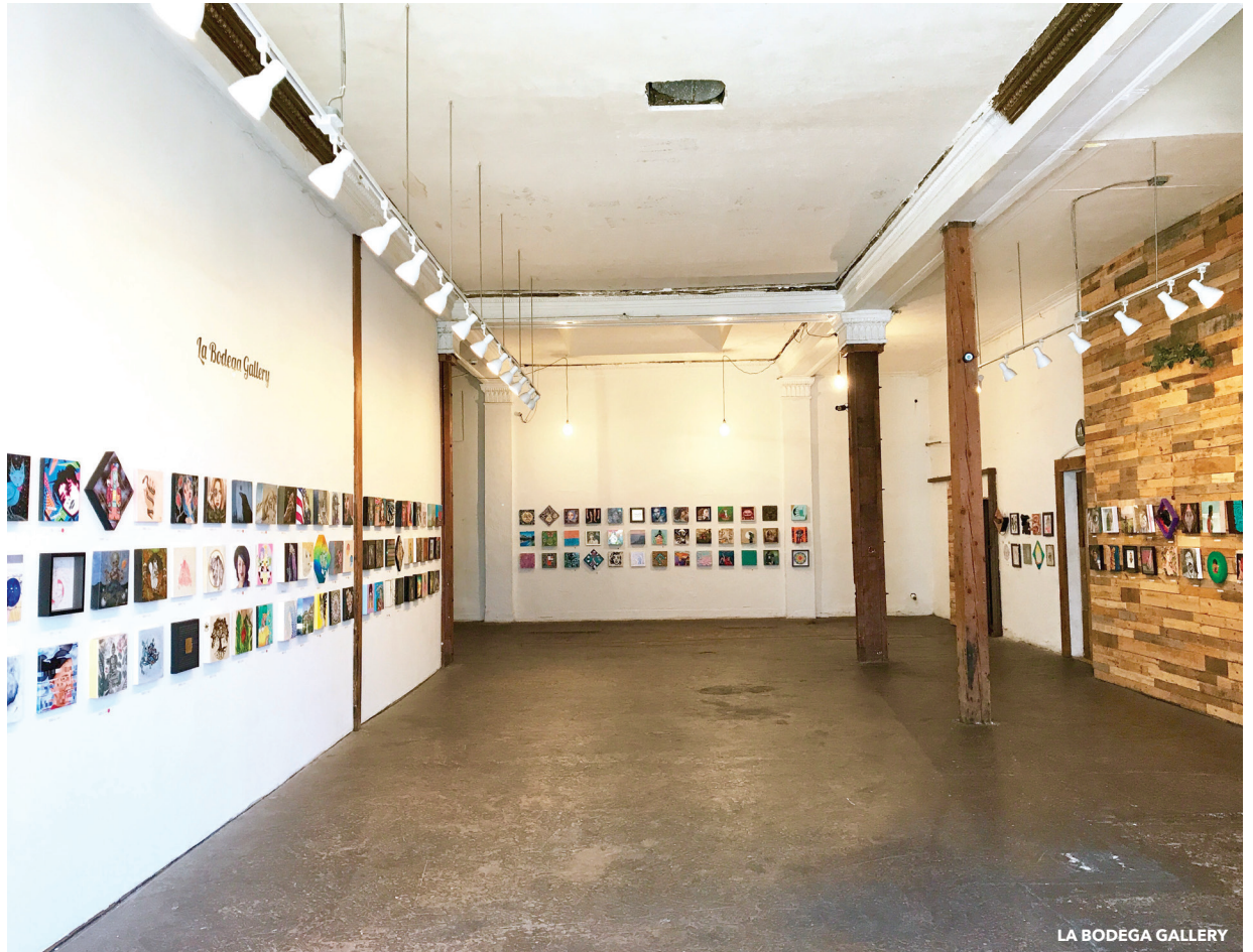
LA BODEGA GALLERY

Take a Walk → Chicano Park is home to a vast, colorful collection of outdoor murals that recount the history of the Mexican-American and Mexican immigrant communities. As a cornerstone of the Chicano Movement, Chicano Park fully immerses you into the rich history that Barrio Logan is all about. CHICANO PARK www.chicano-park.com