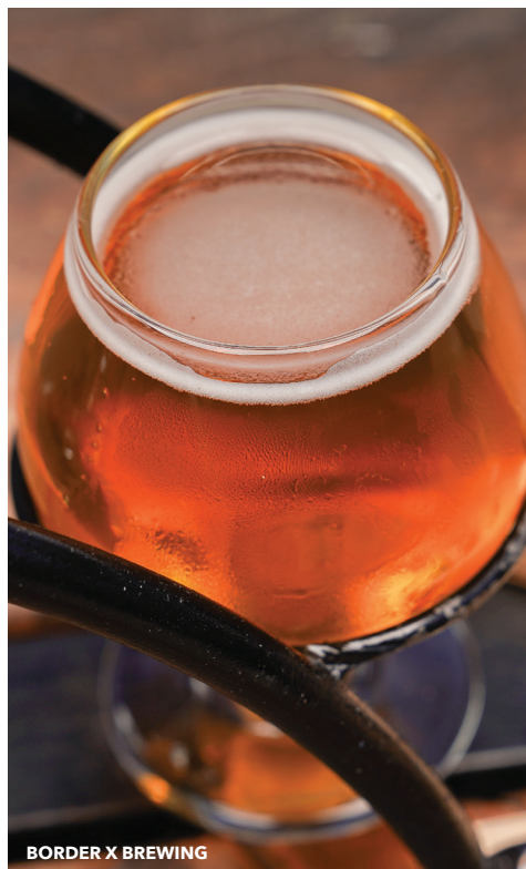
BORDER X BREWING